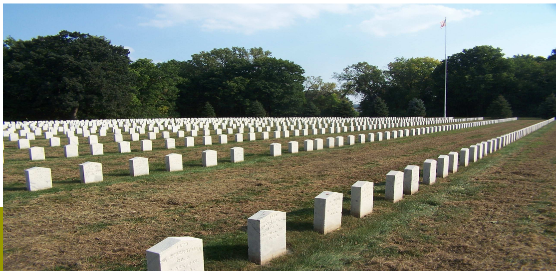
Lest We Forget—The Confederate Cemetery at Rock Island Arsenal

David Jameson 15632 Polk Circle Omaha, NE 68135 dmjameson@cox.net (402)896-1345